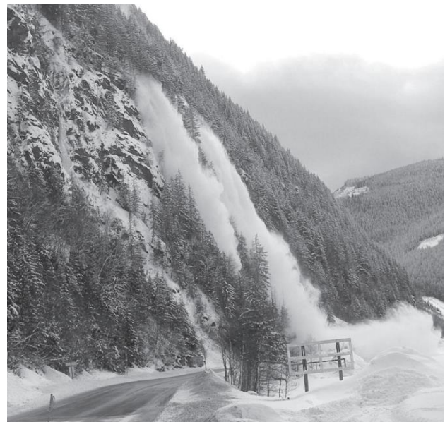
Figure 3: A plunging avalanche from 3VG impacts the Trans-Canada highway (BC MoTI photo).

The first four towers were ready for use (Figure 3) for the 2016/17 winter, and all nine towers were fully operational for the 2017/18 winter.