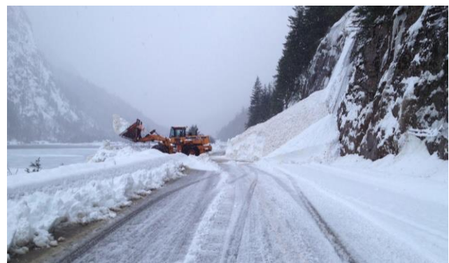
Figure 5: Avalanche deposit removal at 3VG.

The overall 3VG project costs were approximately $2.3 Million CAD. Compared to the average annual closure hours of 46.5 hours, a closure hour reduction of 25 hours during the first winter (with 4 of 9 RACS installed) and 17 hours during the second winter (with all 9 RACS installed) suggests a full return on investment for the public during the first two years of operation. This demonstrates the economic benefit of this system which, combined with the reduction of risk to the travelling public and workers, speaks highly to the benefits of using RACS for important highway corridors.