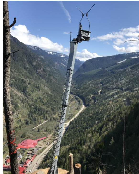
Figure 2: RACS installation at 3VG.

The RACS is operated from the highway by an avalanche technician using a web-based interface connected by mobile phone network or radio. Towers can be operated individually, or multiple towers can simultaneously deploy charges to control multiple paths at once. Charges are dropped from the deployment box and suspended by a cord above the snow surface. The detonation delivers a 360-degree air blast to the adjacent avalanche start zone.